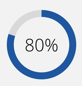
*Findings from a CRBC user survey.

80% of parents and guardians prefer iPayimpact online payment system * to top-up their child's account online.